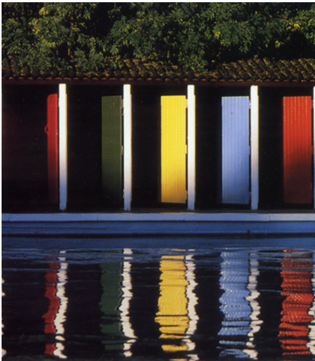
Tooting Bec Lido cubicle doors

We aim to ensure the information provided is correct at the time of going to print but there may be unavoidable last-minute changes in events. Any changes will be posted in libraries, our website: www.better.org.uk/wandsworth-heritage-service and on Twitter: @Better_WHS