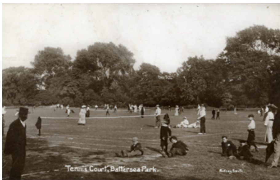
Tennis courts Battersea Park -, early 20th century