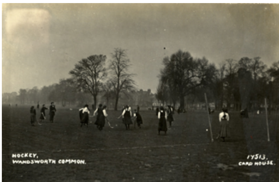
Hockey on Wandsworth Common -, early 20th century