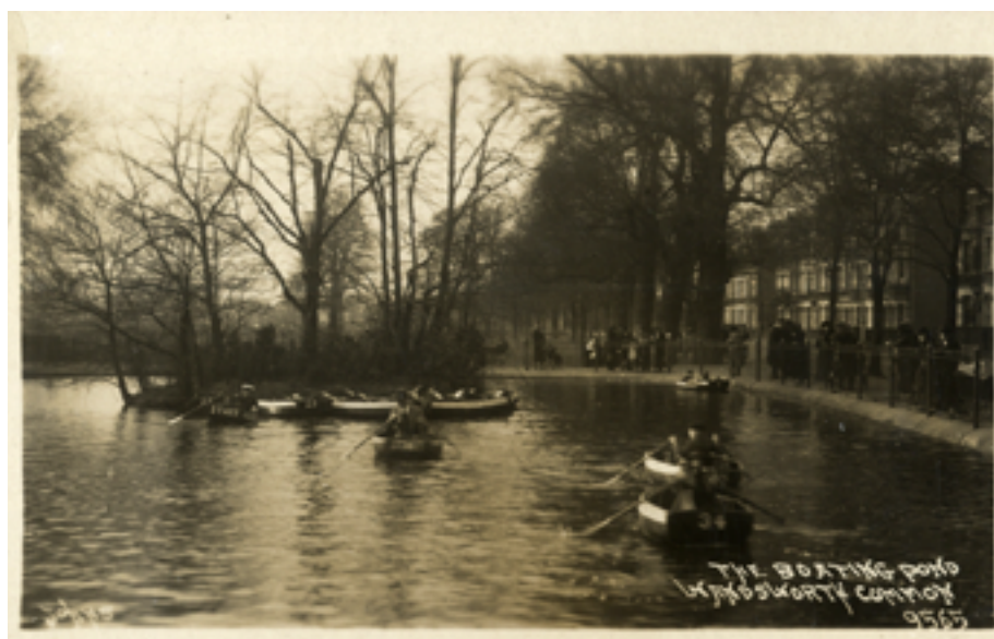
Wandsworth Common Boating Pond c1910s