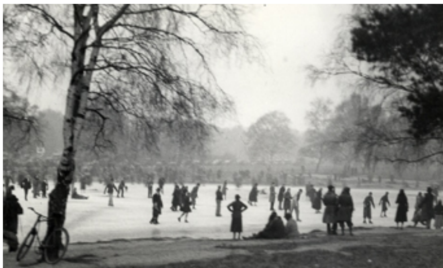
Ice skating on Wimbledon Common, early 20th century