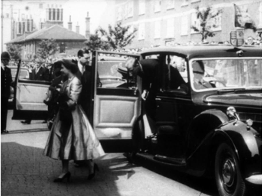
HM Queen Elizabeth II visiting Wandsworth following her coronation, 1953