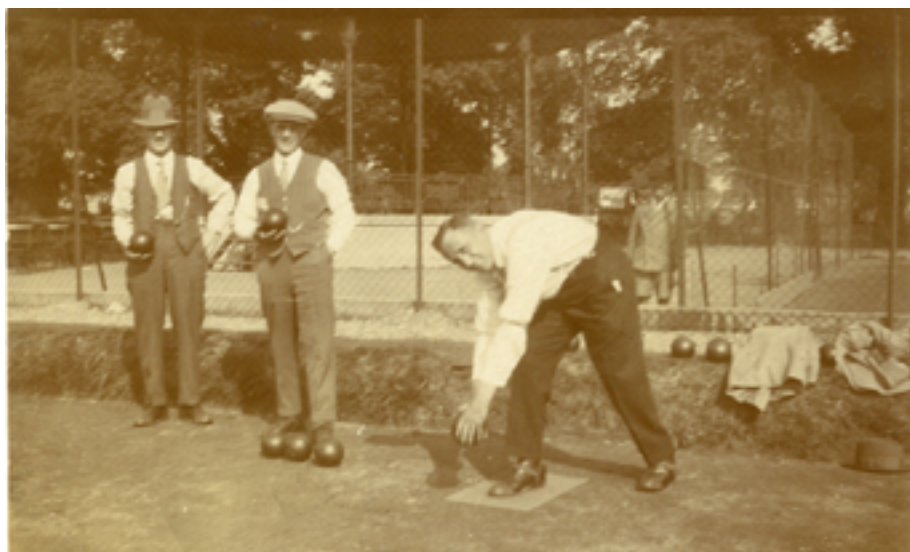
Bowling on Wandsworth Common, c1930s