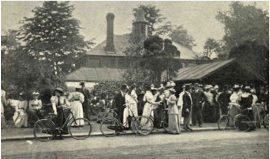
'The Lady Cyclists in Battersea Park', c1910s